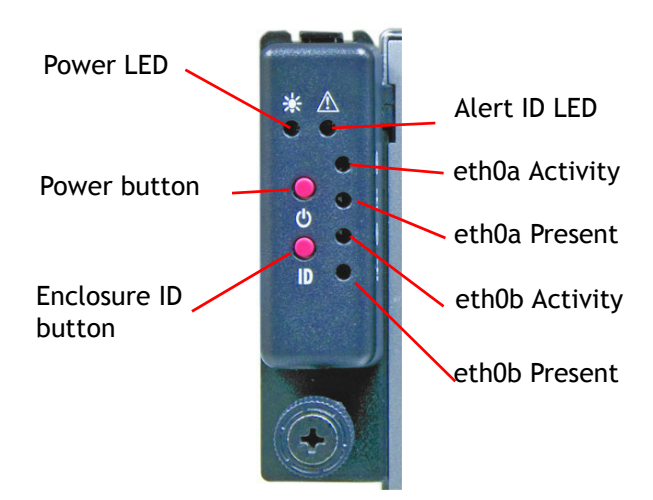
Figure 1: Control Panel Switches and LED Indicators

The control panel is at the left edge of the front panel (see Figure 1).